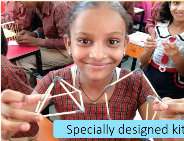
Specially designed kits for Primary class students