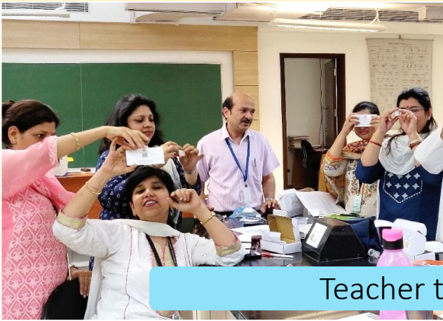
Teacher training sessions