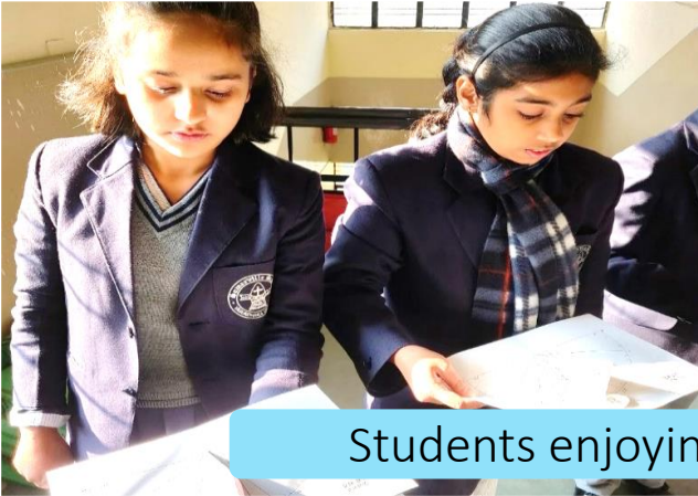
Students enjoying science with our kits